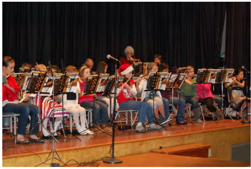
First year band students show off their emerging skills at the Winter Band Concert.